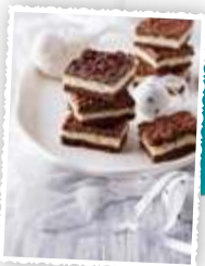
Layered chocolate crackle slice 17