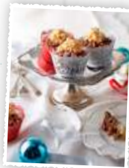
White and dark chocolate crackles 19