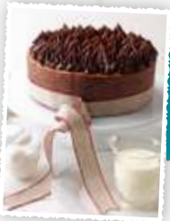
Chocolate mudcake 11