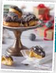
Kahlúa custard profiterole 4