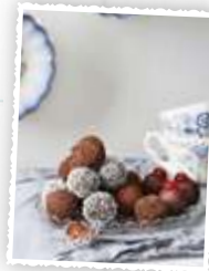
Rum balls 13