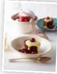
Gluten free mini fruitcakes 6