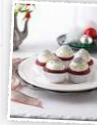
Festive red velvet cupcakes 8