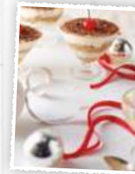
Individual gluten free tiramisu 15