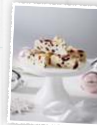
White Christmas 20